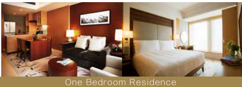
One Bedroom Residence