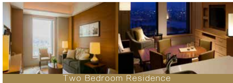
Two Bedroom Residence

Period of stay : 6/5-21/6, 30/6-12/7, 25/8-20/9